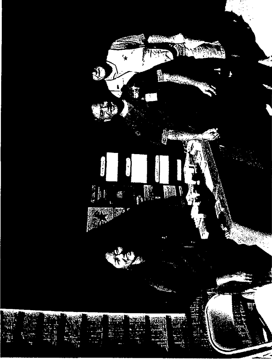
Volunteers staff a community emergency preparedness fair at Kokua Kalihi Valley clinic.