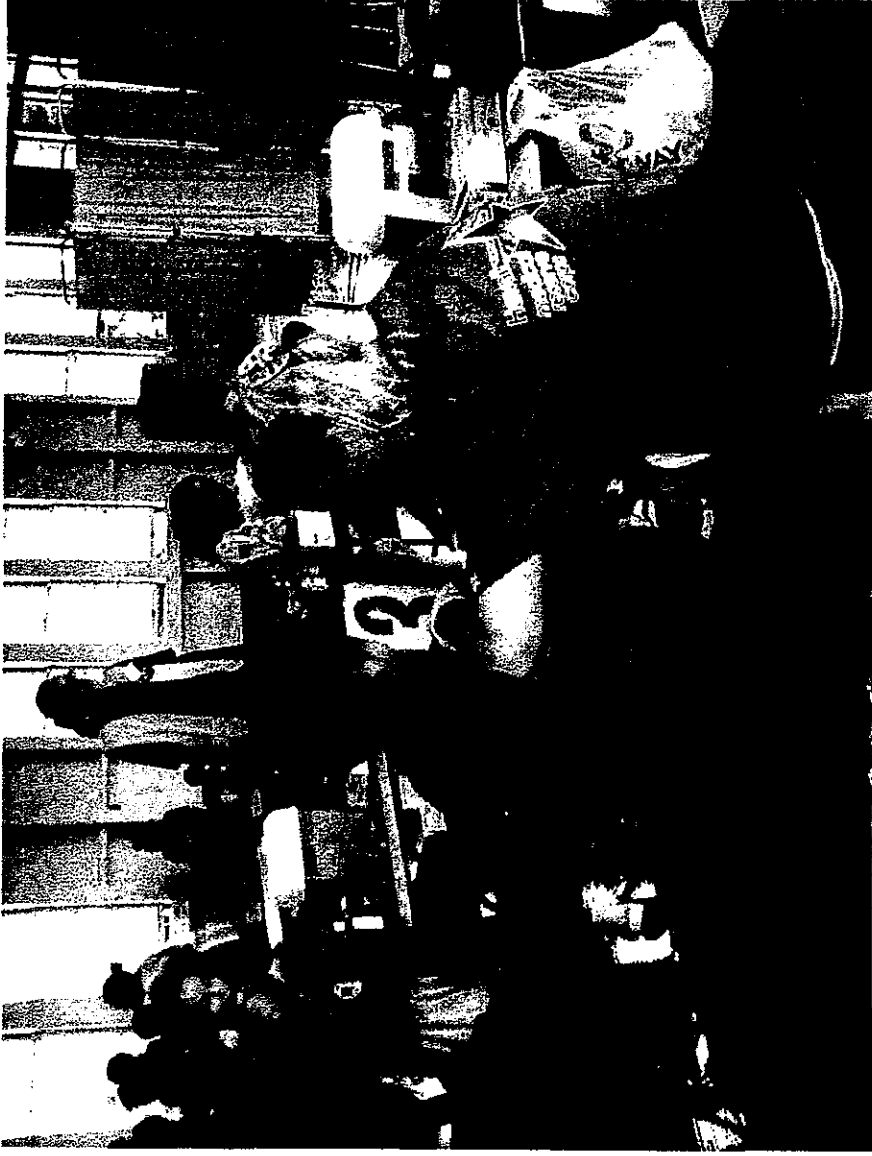
Volunteers work with the Dept of Health to vaccinate Hawaii's school children for influenza.