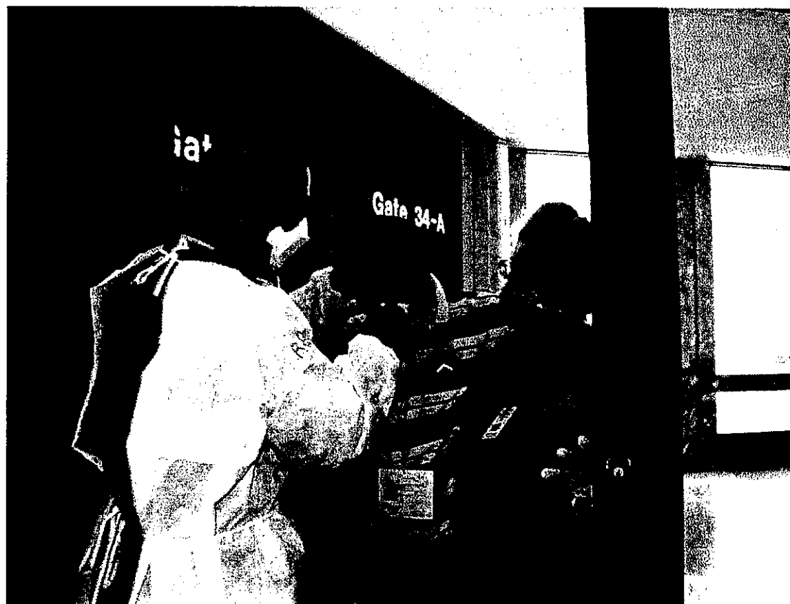
Volunteers participate in Operation Lightning Rescue at Honolulu International Airport.