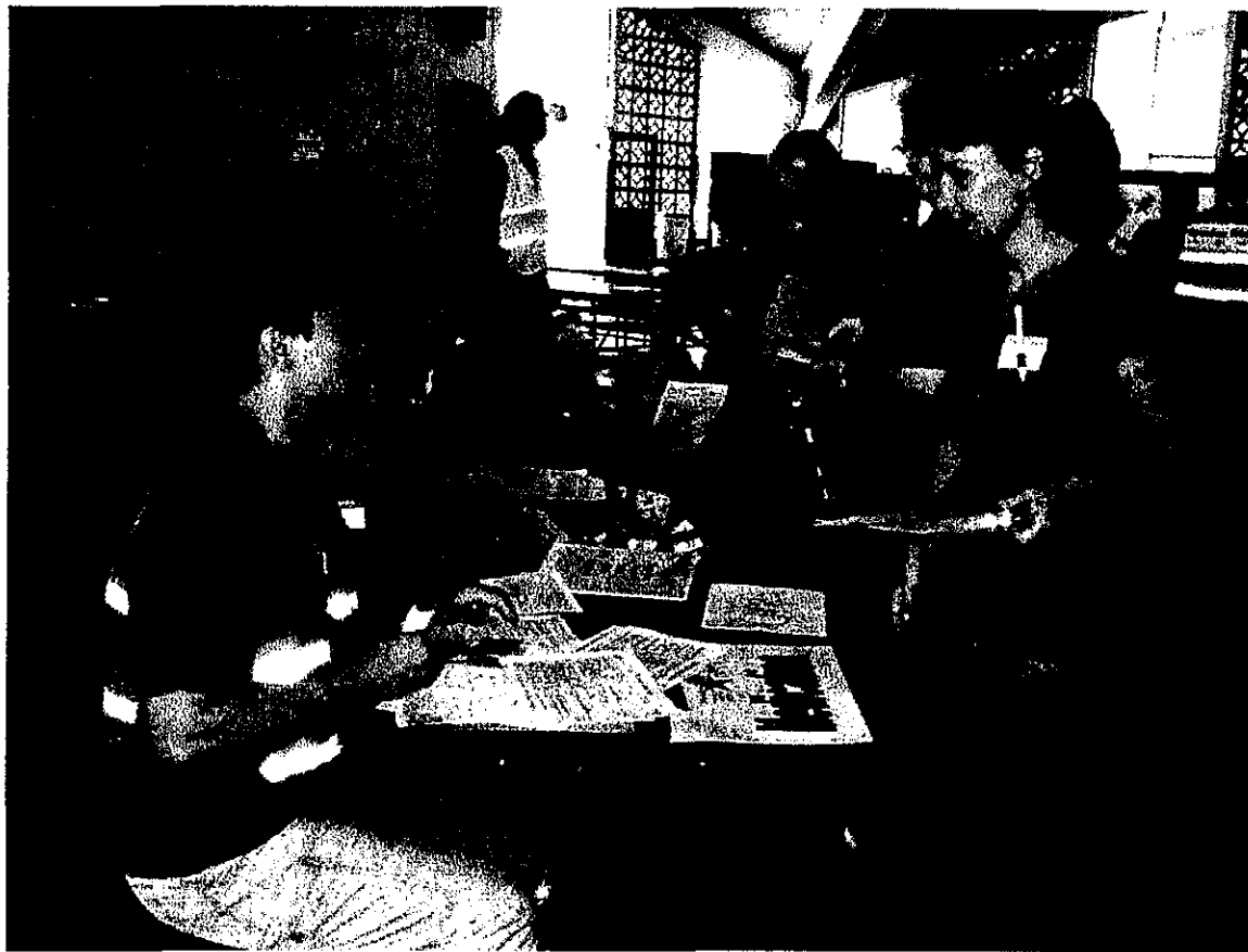
Volunteers practice operations of a Point of Distribution clinic for response to an anthrax attack.