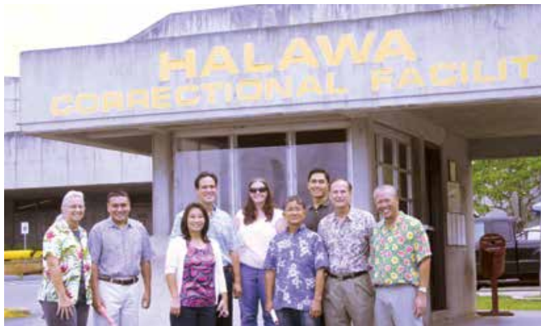
Touring the Halawa Correctional Facility to better understand the issue of overcrowding in prisons in Hawai'i.