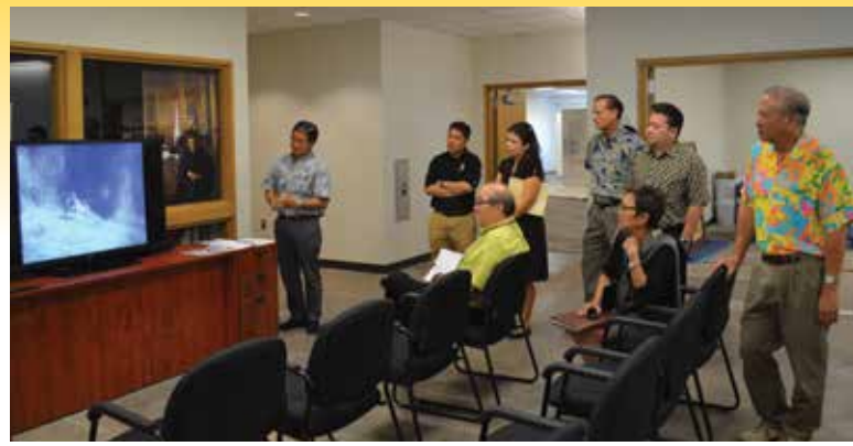
Administrators from the University of Hawai'i, West O'ahu demonstrating the technologies and capabilities of the new campus.

Throughout the year, the House Finance Committee visited several programs and projects supported by the Legislature. The site visits give us a firsthand opportunity to see how departments are spending our tax dollars. This guides the Finance Committee in making important legislative budget decisions. As a member of the Finance Committee, I have participated in all of the site visits, and will apply this information during the session.