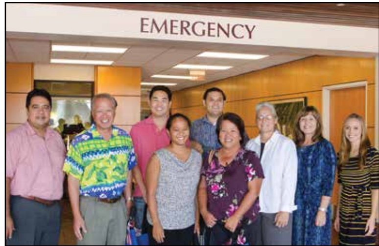
The Finance Committee touring Pali Momi Medical Center, part of Hawai'i Pacific Health, the largest health care provider in the state of Hawai'i.