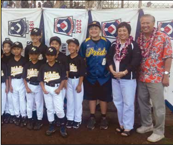
Celebrating opening day of the Pearl City Little League season with team members and U.S. Congresswoman Colleen Hanabusa.

If you would like to be added to our e-mail list, please e-mail reptakayama@capitol.hawaii.gov and we will gladly add you.