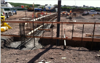
Right: Initial concrete pour for building footings