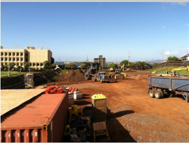
Left: Project site is at the old Aiea sugar mill