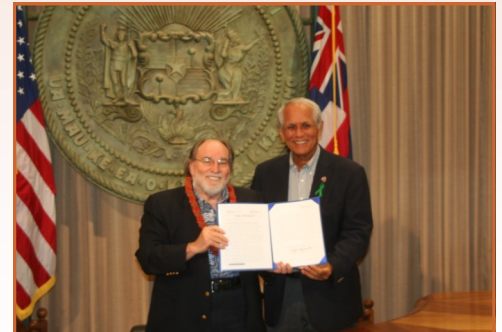
SB 704 Signed into Law April 2011