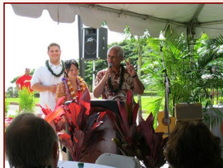
Dedication of Royal Kunia Community Center January 2011