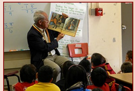
Read Across America Mauka Lani Elementary March 2011