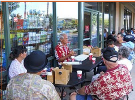
Waialeale Listen Story Meeting November 2010

My next "Listen-Story" community meeting will be at Kapolei Starbucks (next to the Chevron Station) on Saturday, June 18 th from 9am to 10am.