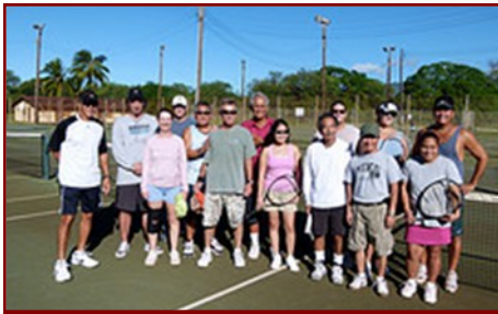
Kalaeloa Tennis Association Work Party January 2011

Our district was very fortunate to be the only one in the state to receive $40 million in construction funding for a new school in the 2012-2013 budget. This will make a big difference for our already overcrowded schools. Kapolei II Elementary will be located adjacent to DR Horton Schuler Division's Mehana residential project off Ft. Barrette Road, across the street from Kapolei High School. In 2009, we appropriated $3.5 million for the design of the school, which Governor Abercrombie is expected to release soon. These funds will allow the Department of Education (DOE) to begin the process of selecting a consultant, who will head up the planning and design of the new school. The DOE will also be working with the Leeward Oahu District Complex on the "visioning process" to determine what the school will look like. We are hoping for a 2015 completion date.