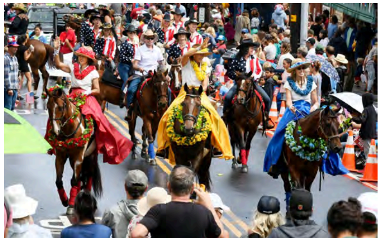
Below: Pa'u riders in the Makawao Rodeo Parade. Makawao, July 7, 2018.