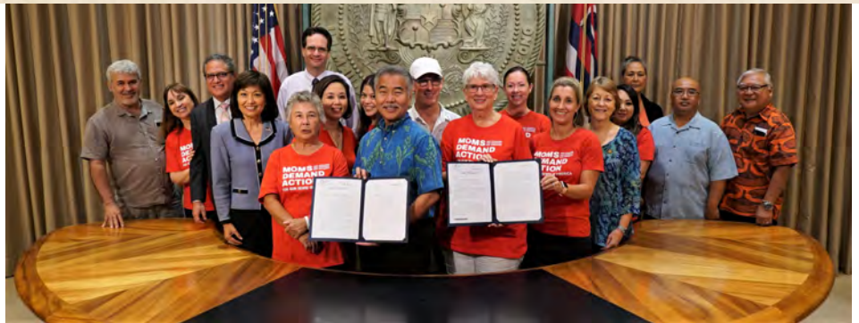
Clockwise from top:

Legislators with "Moms Demand Action For Gun Sense" at the Bill Signing Ceremony for SB2046 (Act 157). Executive Chambers, Honolulu, July 9, 2018.