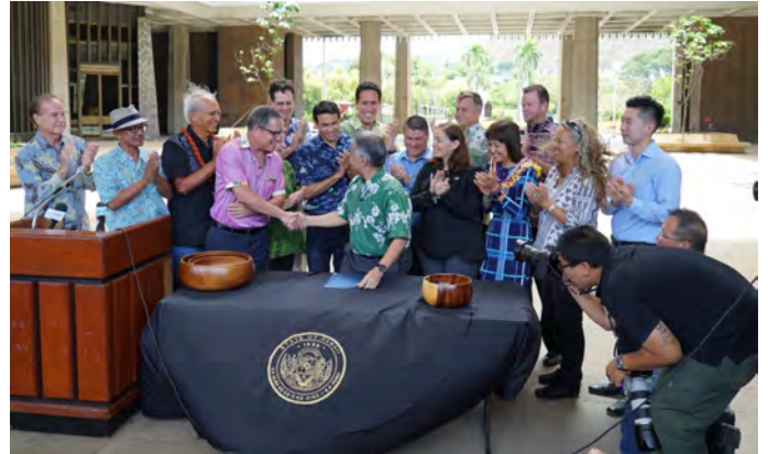
Legislators including Sen. English, and Rep. DeCoite participate in the Bill Signing Ceremony for the sunscreen ban. Honolulu, July 3, 2018.

"Coral and coral beds are the bedrock of our islands, they hold cultural significance and in our district, the reef system and ocean continues to be a source of life and sustenance," said Sen. English. "I am happy that through our persistence and hard work the ban became law."