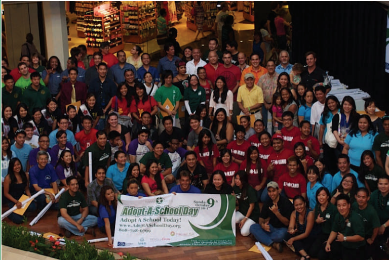
4th Annual Adopt-A-School Day Rally at Ala Moana Center on Sunday, September 25, 2011. For more information, or to adopt a school, visit www.adoptaschoolday.org