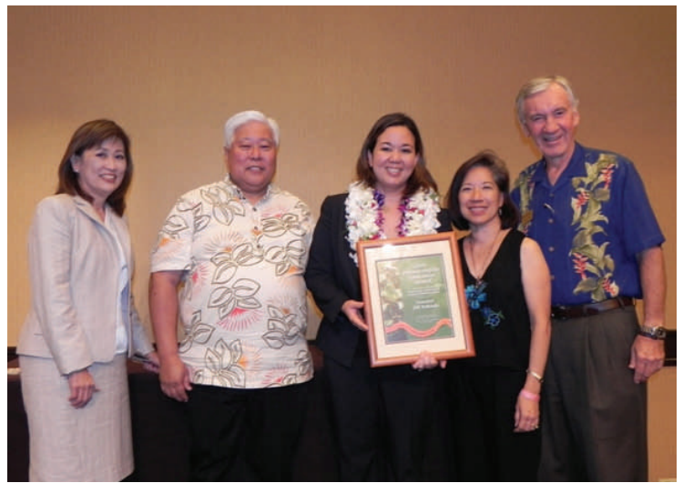
Senator Tokuda was recognized by the Hawaii Chamber of Commerce and the Hawaii Department of Education with a 2011 Partnership in Education Award for her support and participation as a mentor for students working on their BOE Senior Project.