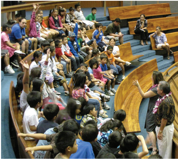
Senator Tokuda and Representative Ito speak with third grade students from Kaneohe Elementary as they spent a day visiting the Capitol. The eager and inquisitive students asked questions about the building, their school, and legislative jobs.